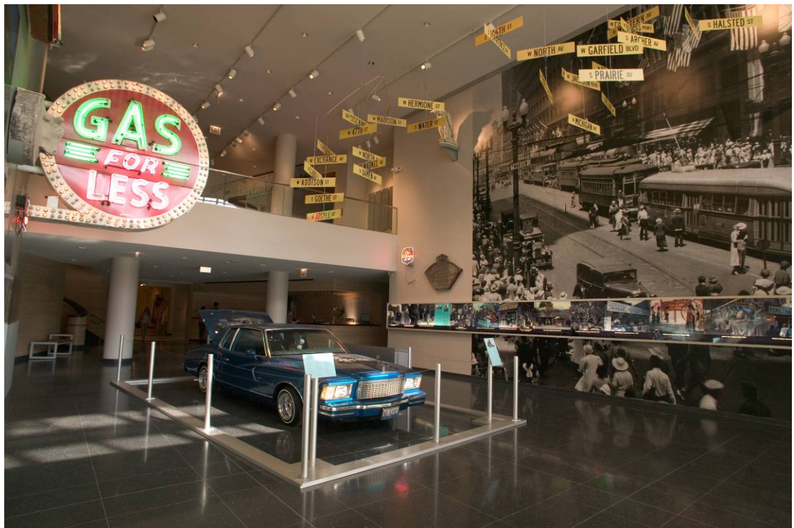
The lowrider is parked in the Museum's main lobby with other objects that reflect Chicago street life, such as a four-foot-tall terracotta owl from Chicago's North American building and a sign from the historic Maxwell Street market

For example, one of the most striking features of the new Museum greets you when you first walk in the door: a 1978 Monte Carlo lowrider dominates the main lobby. Custom-designed and built by the Amistad Car Club of Cicero, a largely Latino community just outside of Chicago, the lowrider was a commission for the Treasures exhibition program. For most patrons, the car is their first encounter with the new Chicago History Museum. Heads turn. Sometimes eyebrows furrow. You can almost see some visitors silently ask: What the heck is that doing here? But the lowrider is the object that best reflects the direction of the new Museum. It's unexpected. It reflects the impact on the city of Chicago's fastest-growing ethnic community. And it's an accessioned CHM object. It's history in the making.