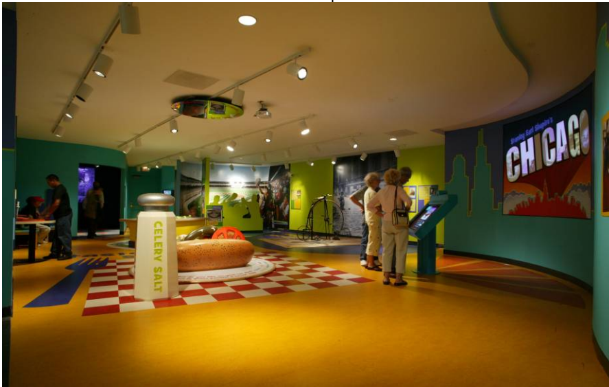
A view from the entrance to Sensing Chicago . The gallery explores history through the five senses.

past. With two centuries of rich and varied Chicago history from which to pull content, the team had the freedom to use only the stories from the city's past that best communicated the message, resonated with the audience, and provided opportunities to develop interactive experiences with history.