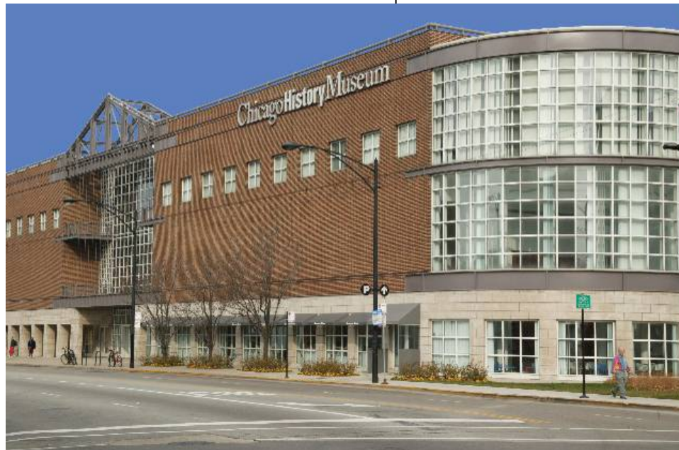
The Chicago History Museum is located at the intersection of North Avenue and Clark Street on the southern tip of Lincoln Park.