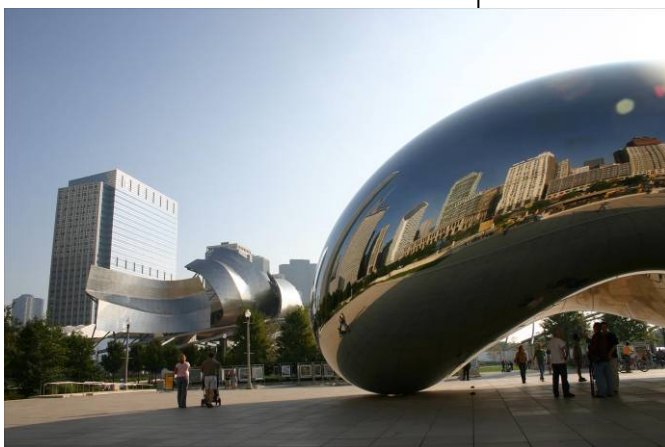
Sights of Chicago: Cloud Gate (The Bean), designed by Anish Kapoor, Millennium Park, Chicago Photo courtesy Jim Hoobler

Linda Eppich The Preservation Society of Newport County