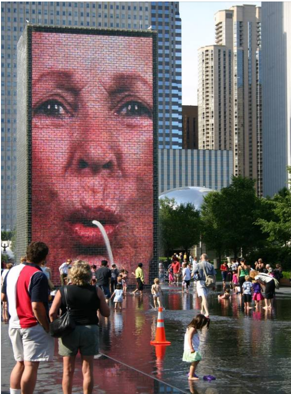
Sights of Chicago: Crown Fountain, designed by Jaume Plensa, Millennium Park, Chicago

The list continues to grow in popularity and topics being discussed are the new Georgia Museum Property Act, collections and exhibitions sharing, cooperative collecting, funding sources for conservation, collections storage issues, the changing role of museums in society and how that is affecting curatorial positions, issues of academic freedom in interpretive labels and programming, sources for curatorial volunteers, stewardship and interpretation of collections, professional development opportunities, standards for exhibition labels, and collections management databases. These topics are not necessarily Georgia-specific, so if you would like to be added to the group please contact James at jburns@boothmuseum.org